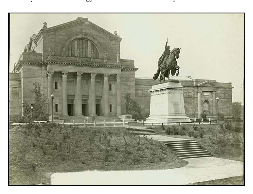
Saint Louis Art Museum

The project was supported by the Institute of Museum and Library Services (MLS), under the provisions of the Library and Technology Act as administered by the Missouri State Library.